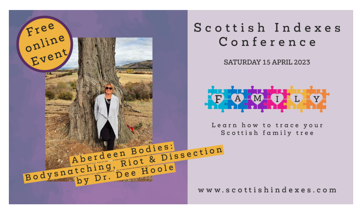
'Body Snatching and Dissecting the Destitute'